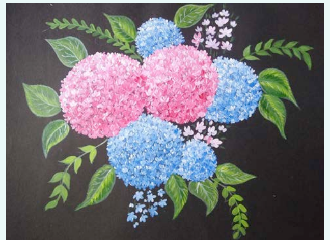
Painting by Varsha 2014-17 batch